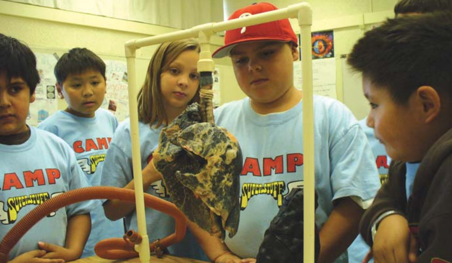
A group of kids attending this year's Camp Superstuff examine a preserved set of lungs, while a counselor demonstrates how the lungs function for those with/without asthma.