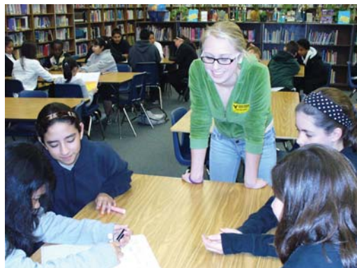
Youth for a Cool Earth utilizes the peer-mentoring model created for our CLASP tobacco-education program (above), with student advocates educating their peers about global warming and coordinating projects to reduce carbon emissions.

In addition, Breathe California has sought to tackle the largest contributor of greenhouse gases - automobiles - by encouraging residents, businesses and organizations to make cleaner car choices. The agency stepped up these efforts in May, when it was named coordinator of the Silicon Valley Clean Cities Coalition. One of 100 such