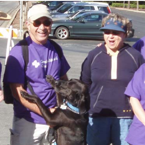
Walkers from Camino Medical Group showed up with co-workers, loved ones, and even their pets, to fight the asthma epidemic.